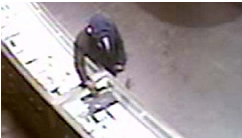
A suspect entered Tiffany and Co located at 727 5 Avenue in New York, engaged an employee in conversation and subsequently removed two necklaces from the counter, before fleeing the scene with the necklaces.