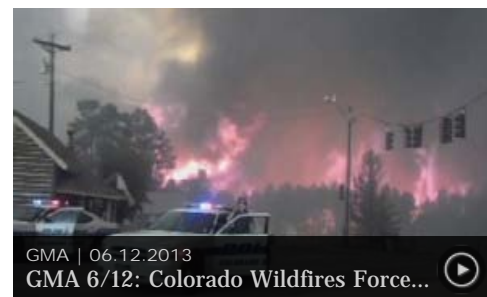
GMA | 06.12.2013 GMA 6/12: Colorado Wildfires Force...