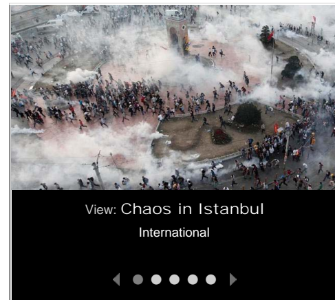
View: Chaos in Istanbul International